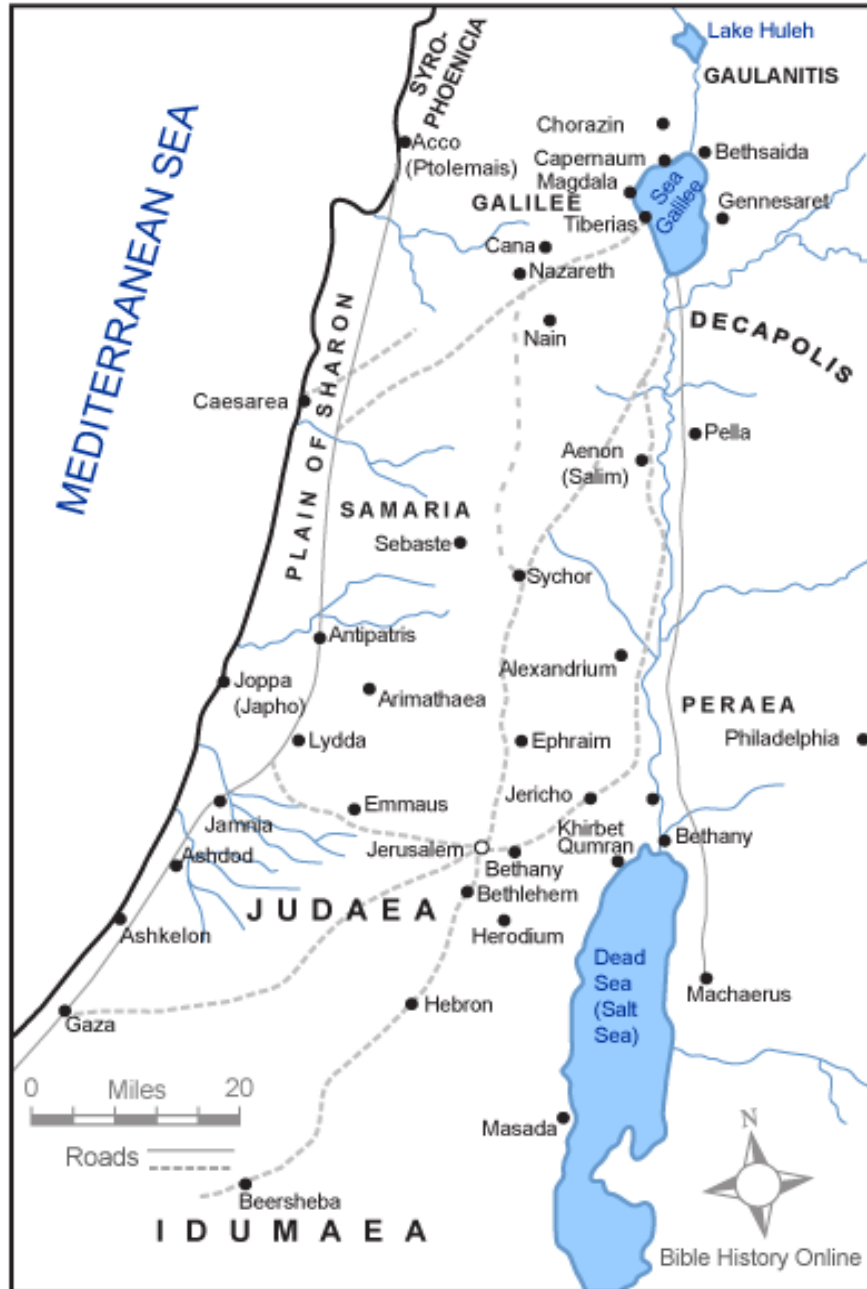
Map of Ancient Israel 1